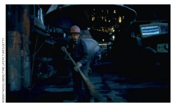
Could a coal gas revolution make dirty coal-fired power stations a thing of the past?

turning hydrogen, carbon monoxide and CO_2 into acetic acid and acetates; and hydrogen and CO_2 into methanol. The region already has a pipeline network for supplying hydrogen. Similarly, in Scotland, the giant Grangemouth chemicals complex is importing gas from North America while coal seams sit unused just a few hundred metres offshore under the Firth of Forth. Bradbury argues that a UCG revolution in the UK could dramatically